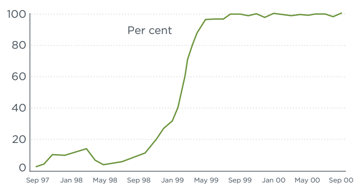
Figure 1-B. Market share of the 50-ppm sulfur diesel